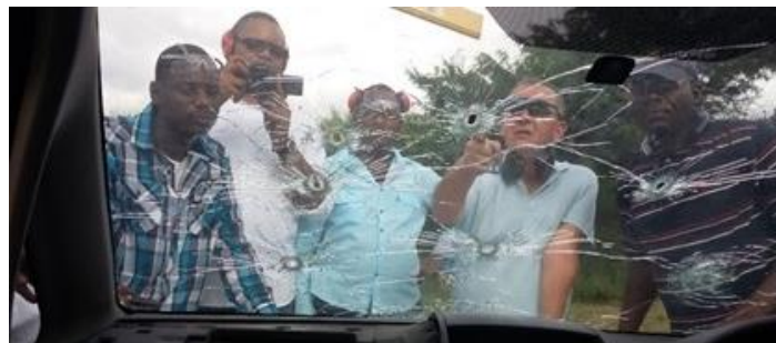
Participants document sequence of the bullet holes on windscreen.

6-10 November: UNLIREC conducted an Executive Seminar for executives of institutional clients of Forensic Ballistics on 6 November, as well as a pilot shooting incident reconstruction training for ballistic experts of the Institute of Forensic Science and Legal Medicine in Kingston, Jamaica.