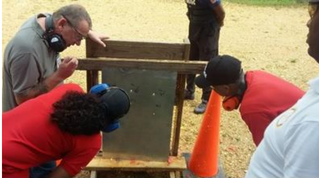
Participants observe bullet holes in sheet of metal at various angles

23-27 October: UNLIREC delivered its pilot Shooting Incident Reconstruction training for Caribbean States, in Trinidad and Tobago.