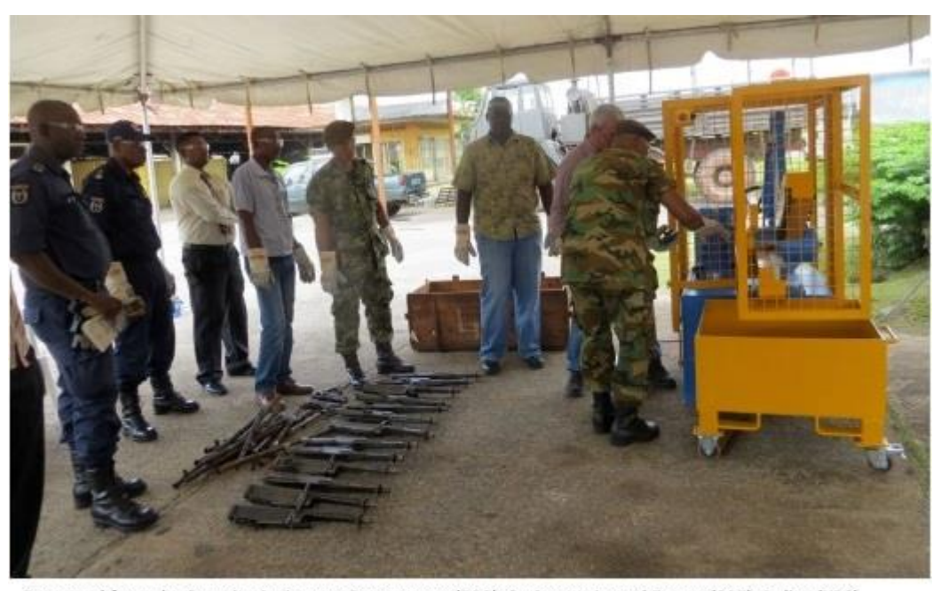
Personnel from the Security Assistance Department (BBS), Suriname Armed Forces (SAF), Police (KPS), Customs and Prisons (DZ) are trained in the operation of the hydraulic shears donated by UNLIREC to the Government of Suriname.

On 02 August 2013, UNLIREC officially handed over a set of hydraulic shears to the Government of Suriname for the destruction of small arms, as well as a Small Arms Ammunition Burning Tank (SAABT) for the destruction of small arms ammunition and explosives. Both of these pieces of equipment were provided to Suriname with a view to ensuring permanent indigenous capacity for regular destruction of weapons and ammunition.