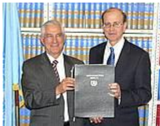
Guatemala's Minister of Foreign Affairs, Mr. Haroldo Rodas Melgar, depositing the instrument of ratification.

Peace, Disarmament and Development, UNLIREC warmly welcomes the ratification of the CTBT by Guatemala and encourages other countries that have yet to begin this process to initiate the proceedings necessary for strengthening security in the region.