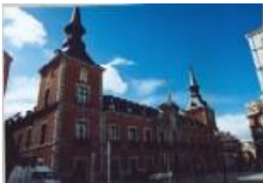
Palacio de Santa Cruz (Santa Cruz Palace), Headquarters of the Ministry of Foreign Affairs and Cooperation (MAEC) of Spain.

The meeting, involving representatives from Colombia, Ecuador, Guatemala, Mexico, Paraguay, Peru and Portugal, was mainly of a practical nature and included instructors from the Ministry of Foreign Affairs and Cooperation, the leadership of the Guardia Civil (Spanish police) from the Ministry of Internal Affairs and UNDP. During the