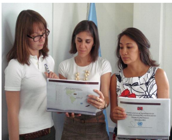
UNLIREC's in-house legal experts reviewing latest legal comparative studies.

Argentina, Bolivia, Colombia, Chile, Ecuador, Guatemala, Honduras, Panama, Paraguay, Peru, Uruguay and Venezuela all formed part of the study. In the case of Guatemala and Panama, having already participated in the 2010 Central American study, they were updated to reflect the