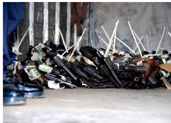
A cross-section of the weapons that were destroyed in Jamaica.

safe destruction of ammunition while ensuring minimal environmental impact. Jamaica is the third such country to use this tank, which has already been implemented by UNLIREC in Ecuador and Trinidad and Tobago.